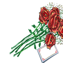
Happy Mother's Day